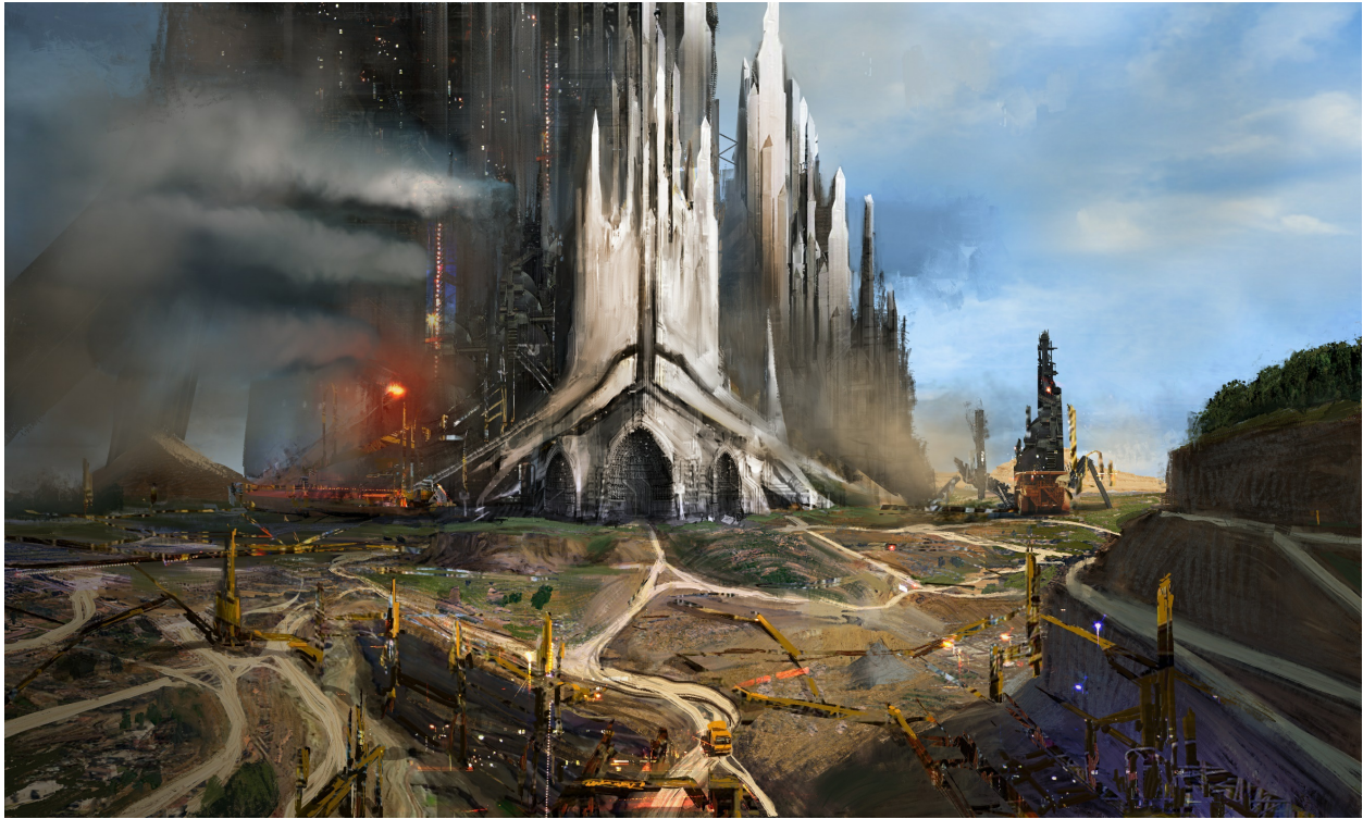
Overview of Helder Ster mega-complex.