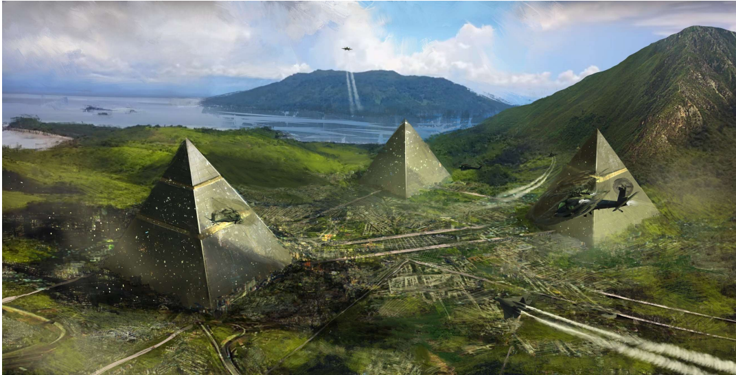
Overview of Tabula Rasa mega-complex.

Cibus is the pyramid where the food resources are produced and distributed around the mega-complex. A wide variety of food supplies are cultivated here, and special care is being taken to maintain a sustainable production of the required supplies.